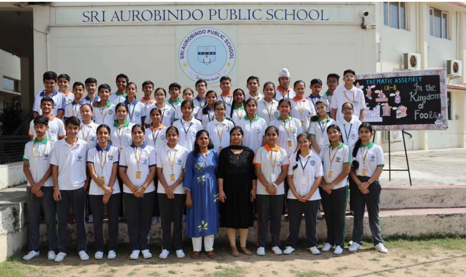
IX B TOPIC : ROLE PLAY ON IN THE KINGDOM OF FOOLS

Assemblies are an important part of school life. School Assemblies are a wonderful opportunity for students to come together and learn important values and morals that will help students grow as individuals.