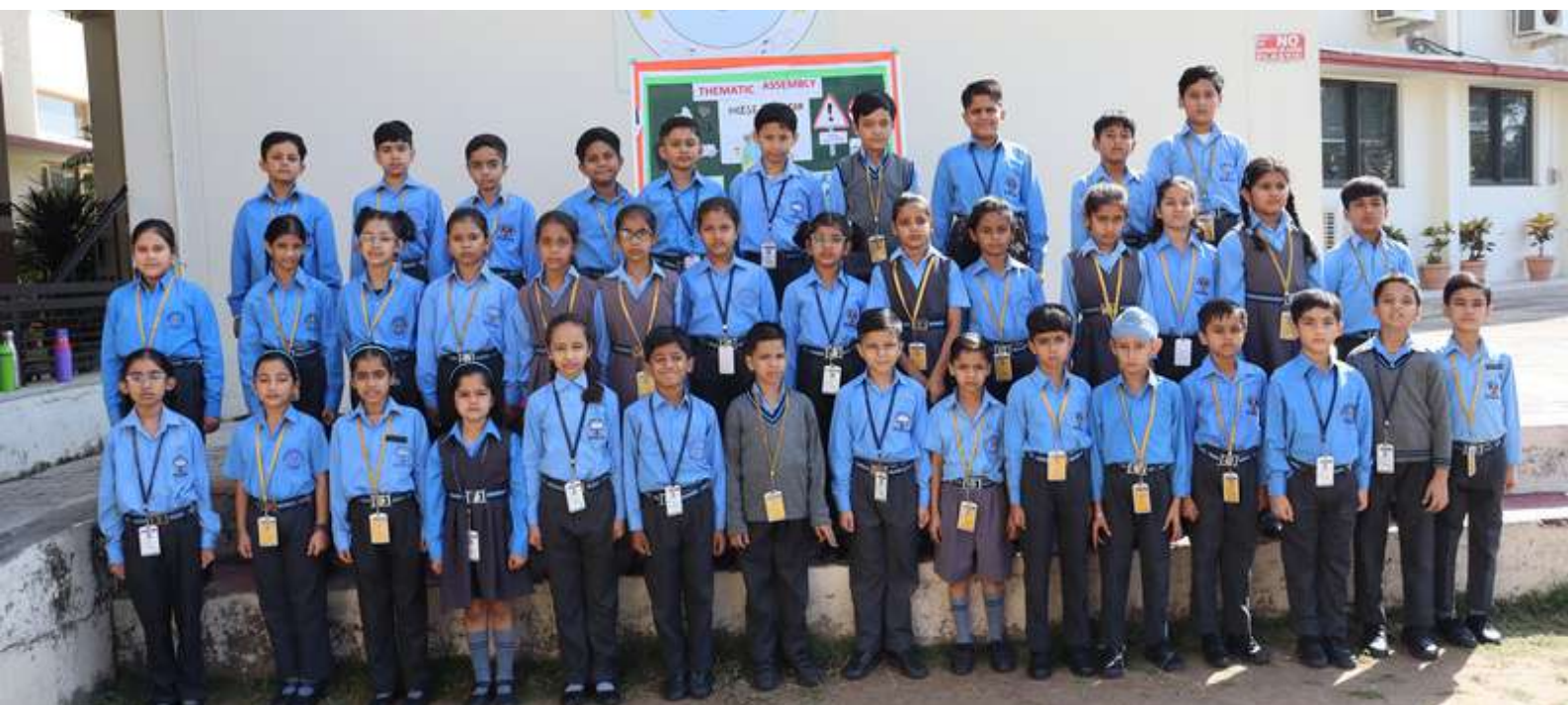
CLASS III B TOPIC : NOISE POLLUTION