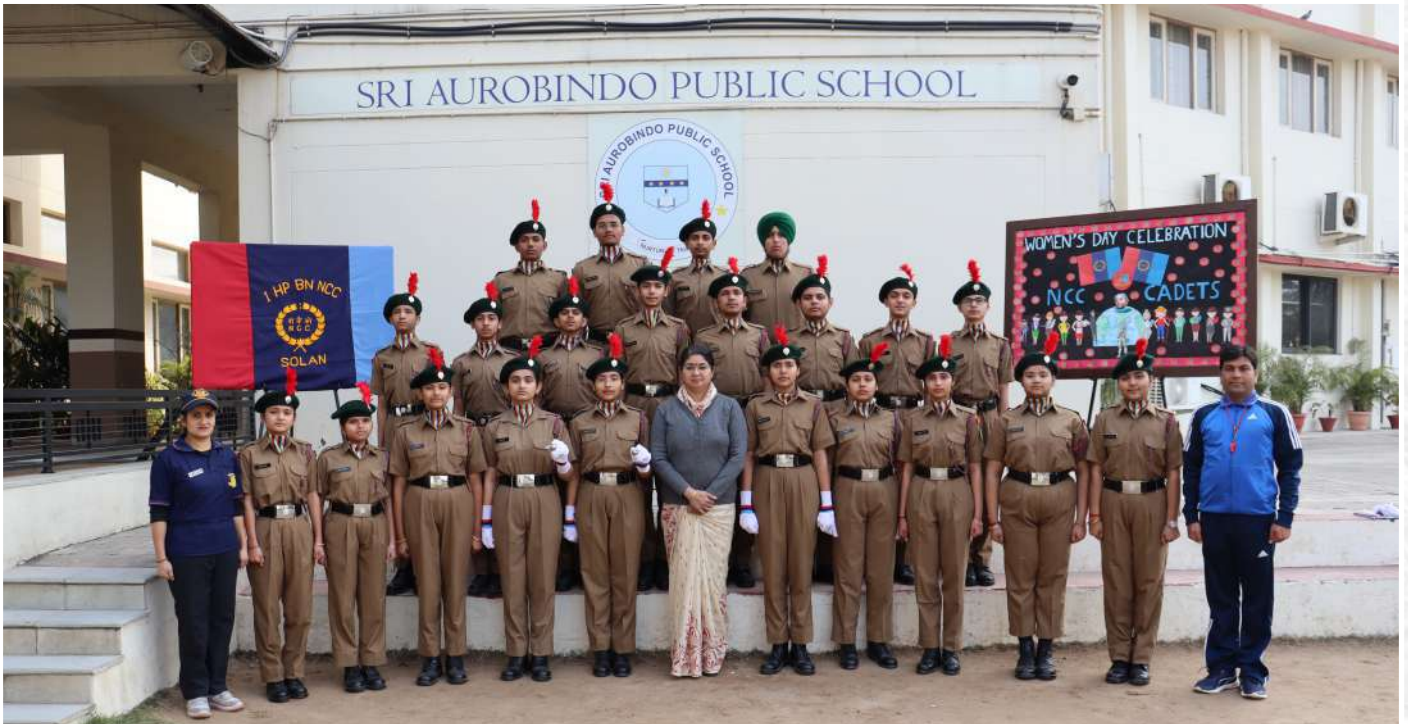
NCC Cadets of Sri Aurobindo Public School, Baddi celebrated National women Day on Feb.13, 2024. The NCC Cadets talked about Sarojini Naidu and many other women personalities in the assembly.