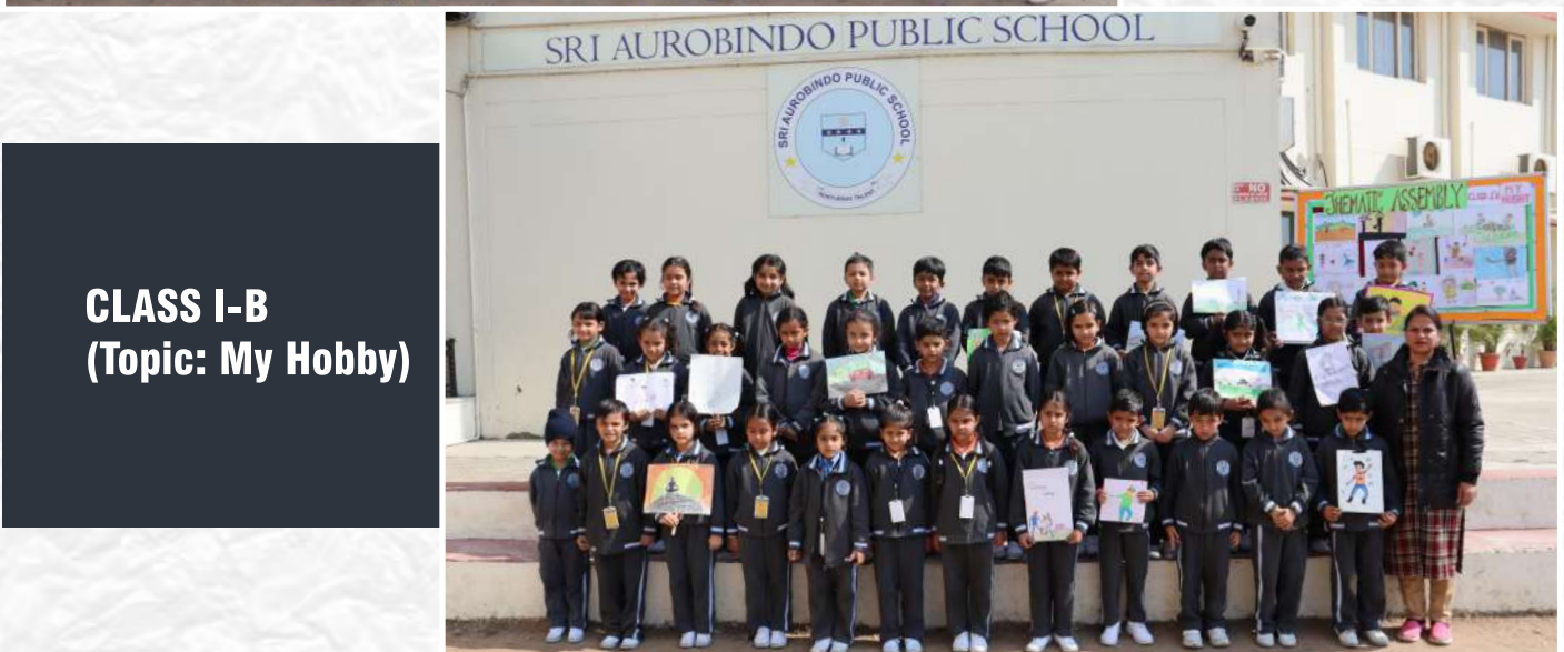
CLASS I-B (Topic: My Hobby)