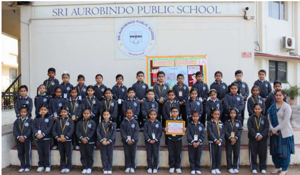
CLASS I-A (Topic: My School)

Thematic Assemblies are organized once a week and help to instill self confidence, self esteem, and teamwork. These assemblies provide students a platform to perform and ward-off stage fright. most students are able to participate.