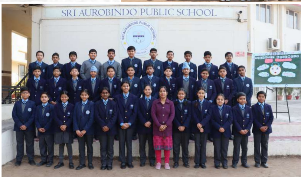
CLASS VII B (Topic: Time Management)